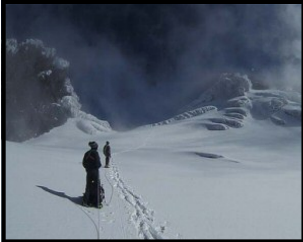
Nearing the Summit of Mt. Stanley

During our expedition, we will enjoy an excellent support staff, local guides and a Western trip leader. This is truly one of the most unique mountain adventures on the globe.