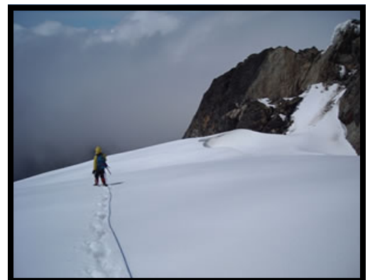
Crossing a glacier on Mt. Stanley