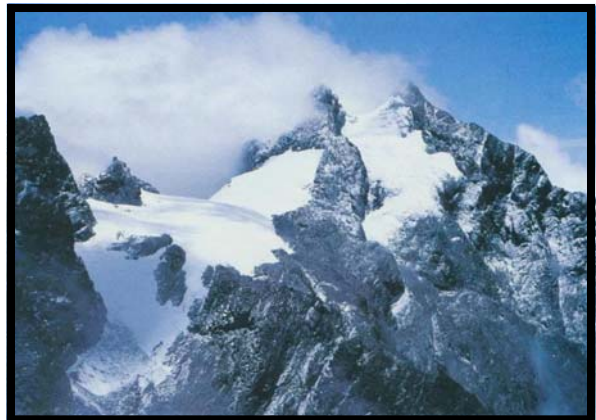
The Mt. Stanley Massif