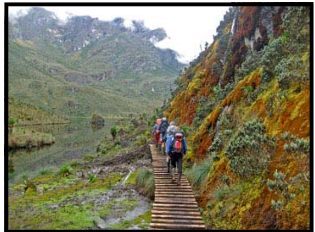
Crossing a boardwalk in boggy terrain